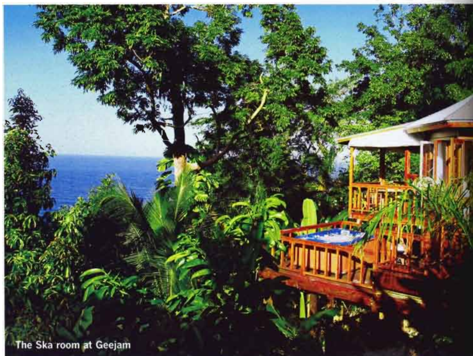
The Ska room at Geejam